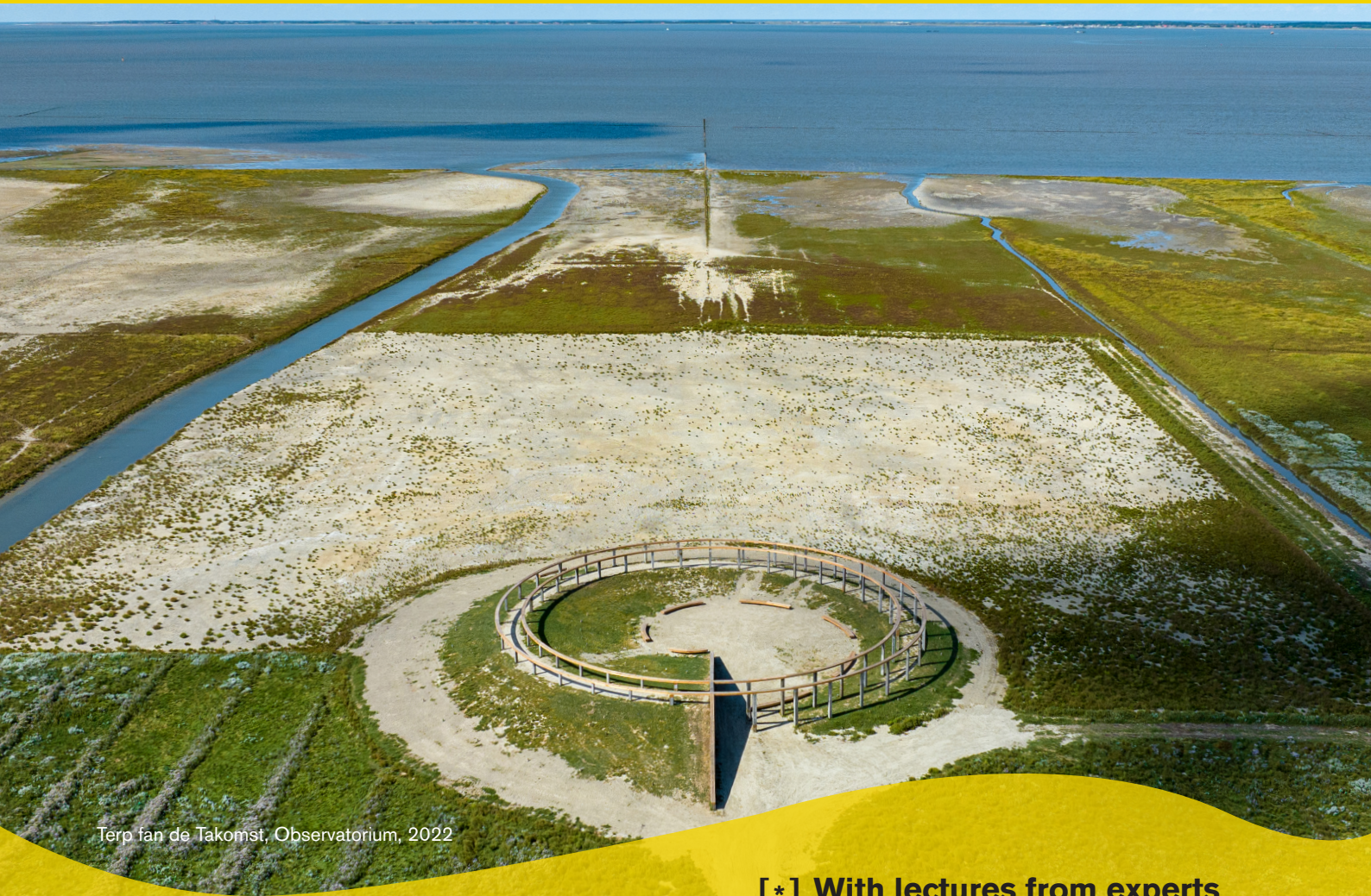
Terp fan de Takomst, Observatorium, 2022