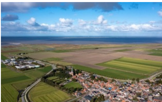
Holwerd aan Zee

Preparatory work is done beforehand and be available to the students during the summer school. A large variety of plans and designs for the Wadden Coast that are now on the table of municipalities, provinces, (inter)national governmental and non-governmental organizations, and water management authorities will be on display, focusing on both landscape conservation and landscape development, assembled in a large collage of what we call the 'Plan Parade'.