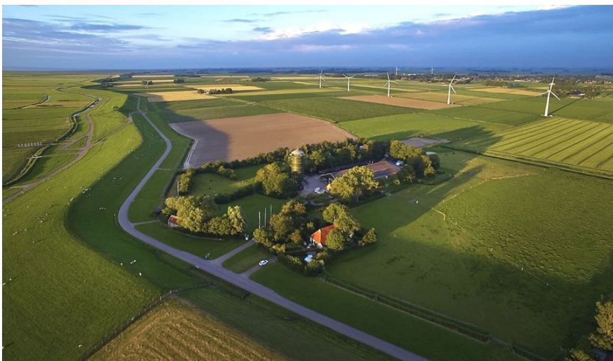
Residence 'Het Lage Noorden'